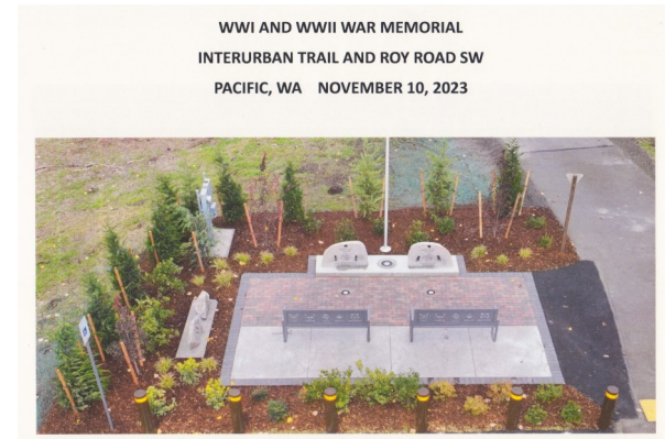
WWI AND WWII WAR MEMORIAL INTERURBAN TRAIL AND ROY ROAD SW PACIFIC, WA NOVEMBER 10, 2023